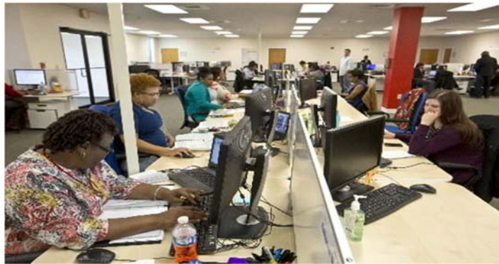
Figure 3. Liberty Source Service Center