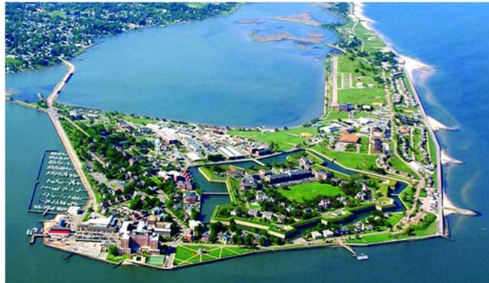
Figure 2. Aerial View of Fort Monroe ("Fort Monroe", n.d.)