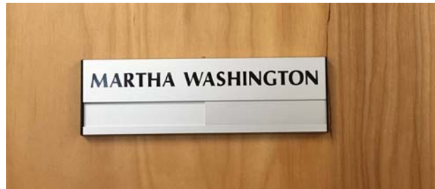
Figure 6. Martha Washington Conference Room

Liberty Source decided not to build its own data center. Instead, it outsourced its information technology infrastructure to the cloud. Hosley explained why: “The power of leveraging the cloud-based infrastructure-as-a-service allowed us to be scalable and secure day one, preserving much of our capital for investment in our staff”. Liberty Source worked with cloud offerings from such companies as Microsoft, ADP, Genfour, and NetSuite.